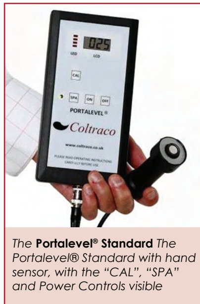
The Portalevel® Standard The Portalevel® Standard with hand sensor, with the “CAL”, “SPA” and Power Controls visible

Details explained in Operating Instructions or available on request