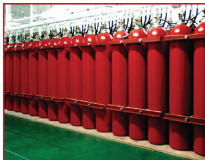
Typical application for the Portalevel Standard includes CO2 Cylinders (as pictured above) FM200, NOVEC, Halon and a variety of other similar cylinder types